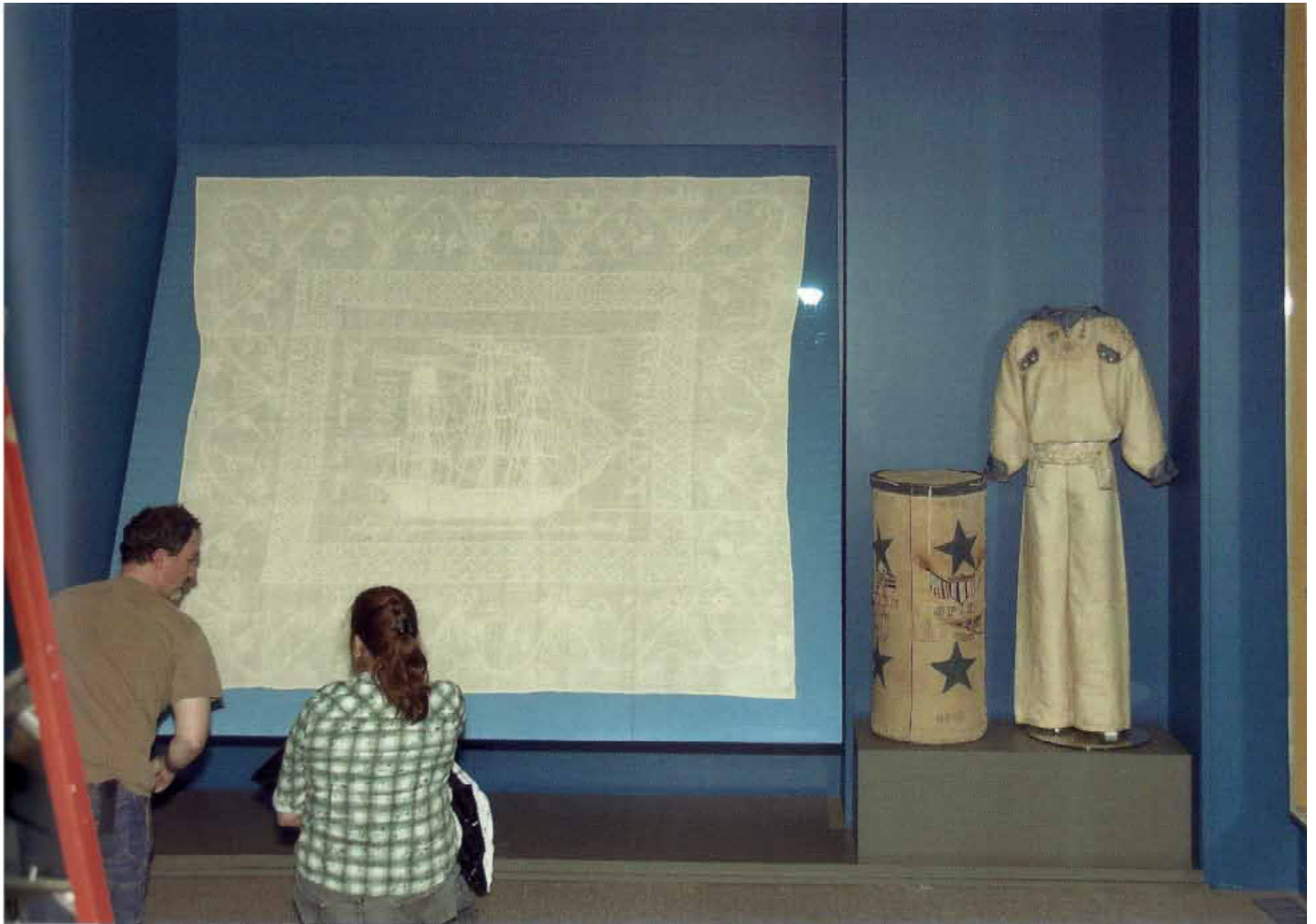
The Optium is in place but invisible to the viewer. The seam between the two sheets nearly disappears.