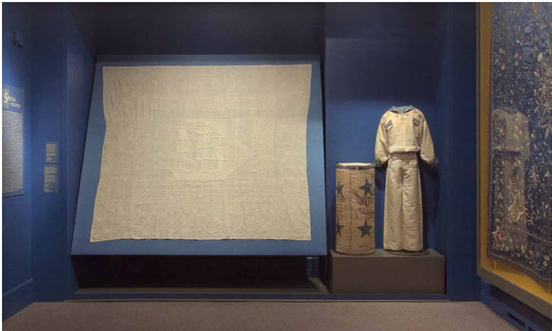
Tru Vue, Inc.'s Optium at Winterthur for With Cunning Needle: Four Centuries of Embroidery