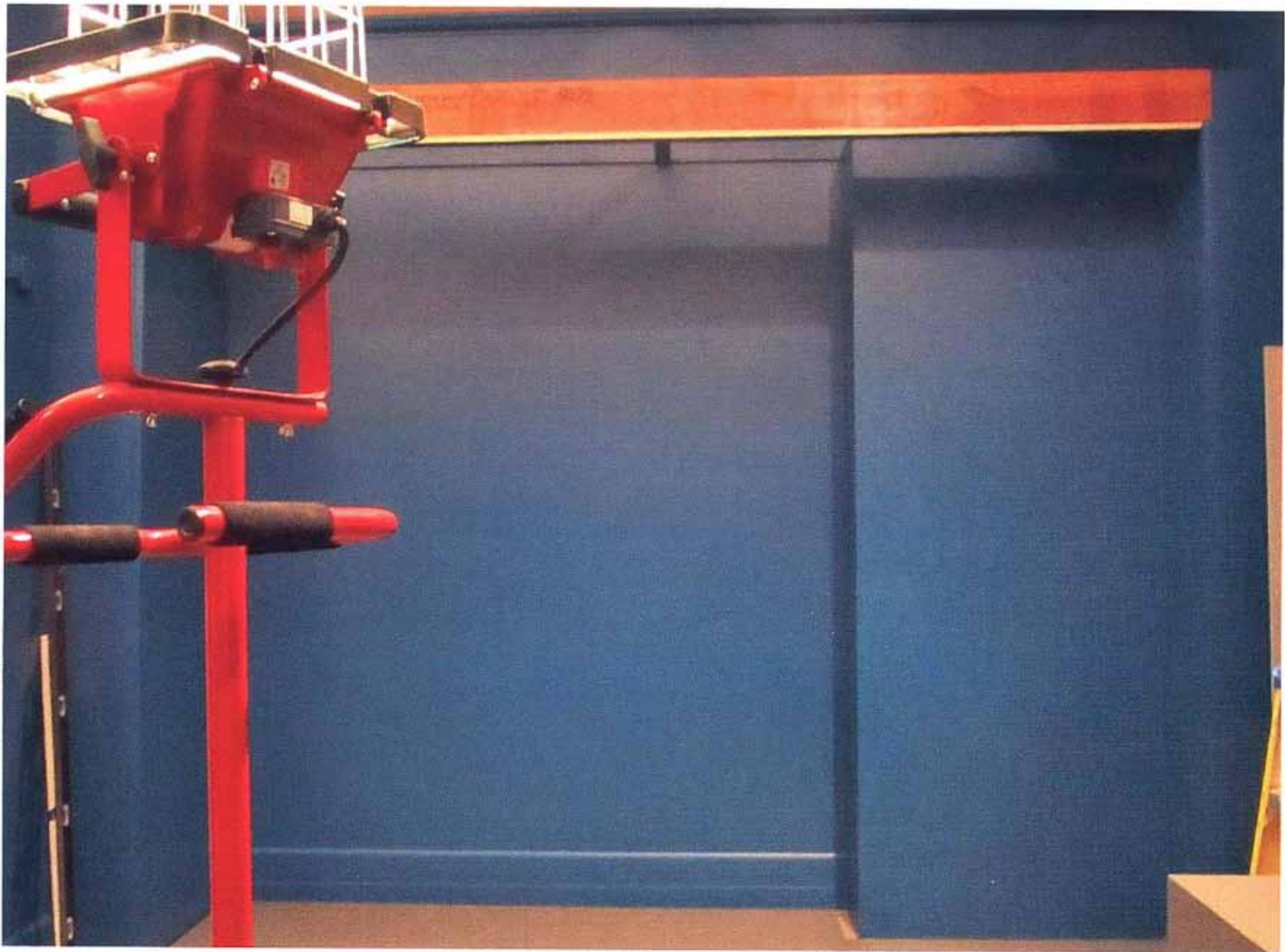
Winterthur's exhibition team planned this niche to display three embroidered objects relating to a nautical theme. The top rail will serve as the support for two sheets of Optium standing on end.