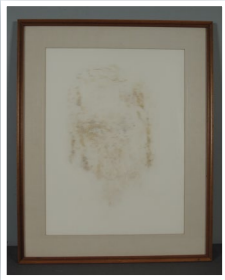
Example of pastel offset

Anti-static sputter-coated acrylic protects and displays fragile artwork. The static charge of many conventional glazing products may be enough to damage friable media, such as charcoals, pastels, artwork with delicate surfaces, lightweight papers and textiles. Friable media contain minimal binding agents and, without adequate protection, may separate from their support or crumble into a powdery form. Smaller and lighter particles, such as fine powder pigments of pastels, are more likely to be detrimentally affected by static charge.