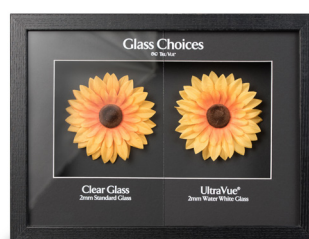
UltraVue Display M99-01053INT