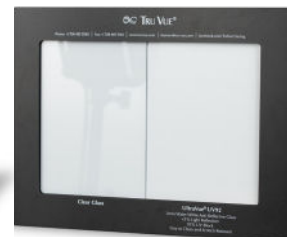
UltraVue UV70 Specifier M99-01282