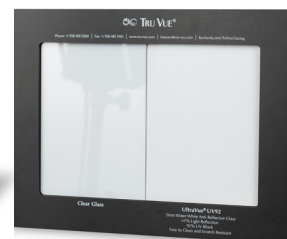
UltraVue UV70 Specifier M99-01282