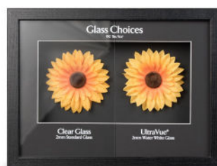
UltraVue Display M99-01053INT