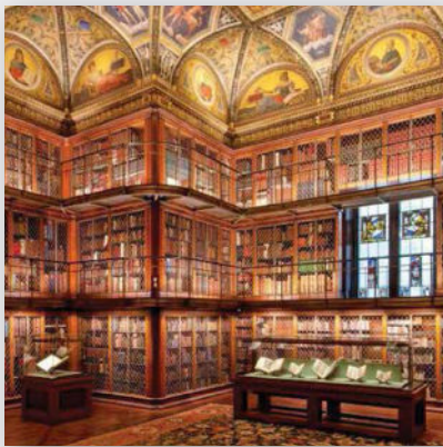
Mr. Morgan's Library (East Room). After restoration. The Morgan Library & Museum, New York, USA.