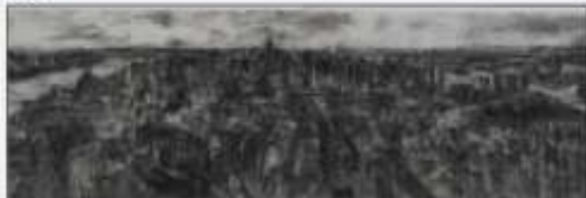
New York Metamorphosis

New York Metamorphosis , a large-scale charcoal drawing on paper created by Norwegian-born artist Torild Stray, was acquired by the 9/11 Memorial Museum in 2017. Stray created the 60 in x 168 in (152.4 cm x 427 cm) panoramic drawing of New York City while an artist-in-residence at the famed World Trade Center artists' residency program, World Views . The program was run by the Lower Manhattan Cultural Council in partnership with the Port Authority of New York and New Jersey. The program provided artists with around-the-clock-access to dedicated studio space in the Twin Towers, offering a rare opportunity to create work from high above the city traffic in one of the world's most renowned landmarks. Stray was among a group of 18 artists chosen for the inaugural year-long class of residents in 1997. More than 150 artists served residencies in the Twin Towers before the buildings' destruction on September 11, 2001 (see Fig. 2).