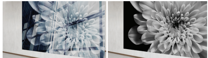
Typical Reflections with Regular Acrylics