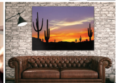
Photography & Fine Art