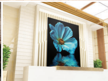
Hospitality & Corporate