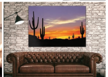
Photography & Fine Art