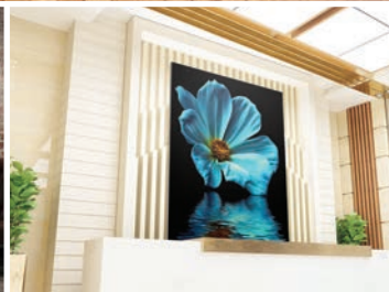
Hospitality & Corporate