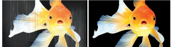
Scratches on Regular Acrylics

Cleans Like Glass – No special acrylic cleaners needed